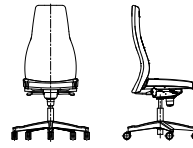
BJARG SWIVEL CHAIR HB UPH