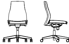
VIDEN SWIVEL CHAIR MB UPH