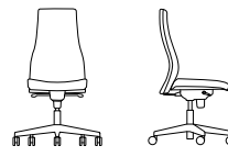
VIDEN SWIVEL CHAIR HB UPH