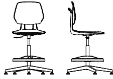
CASSA SPECIAL SWIVEL CHAIR 5A RB