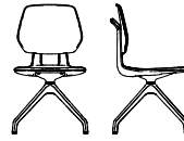
CASSA SPECIAL SWIVEL CHAIR 4S