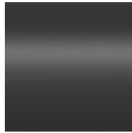
RAL 9005 Black*