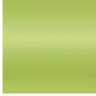
RAL 120 80 60 Lime Green*