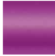
RAL 4006 Purple*