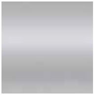
ALC ab. RAL 9006 Metallic*