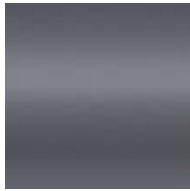
RAL 7016 Anthracite*