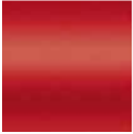
RAL 3020 Red*